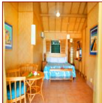
BEACHFRONT SUITE INTERIOR